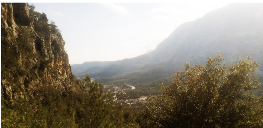
Fig. 24. View from Hayıtlıgöl to Beldibi

The ruins of Hayıtlıgöl are the most remarkable site along the shore between Attaleia and Phaselis, probably the only site deserving to be considered as a polis . There are numerous ancient buildings within an area of at least 10-15 ha . The acropolis of the city is located immediately to the north of the settlement on a large rock outcrop, and over the slopes of which the structures in ruins – mostly Hellenistic – are orientated towards the east. Only ca. 200 m south of this building group, there is a large building with many rooms, which is located to the west of the site and almost closing the western mouth of the shallow valley between the acropolis and the hill to the south of the settlement. Adak and Güzelyürek suggested that this complex might have been an archive or assembly building, or a temple 23 . The inscription was found in front of this building amongst its largely fallen wall blocks. The existence of an ancient path in front of this building is observable, so the treaty was probably erected in front of this building, facing towards the west, as also towards the road and the necropolis, which still retains a few tombs.