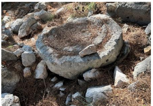
Fig. 18. Olive press basin