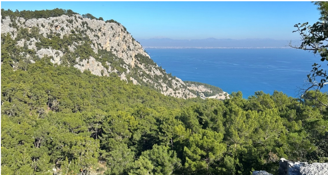
Fig. 23. View from the acropolis of Tenedos towards the north, Antalya