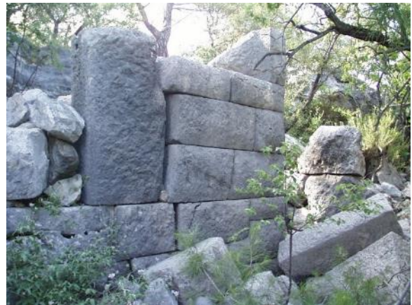
Fig. 16. The Hellenistic building in Fig. 14. Photo taken in 2003 before the large stone at the entrance rolled down