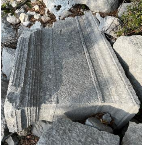
Fig. 7-Fig. 10: The outer walls and their blocks of the building, to which the new inscriptions belonged