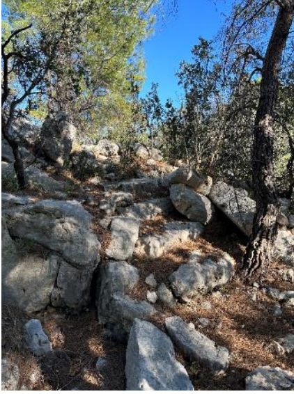
Fig. 19. Steps climbing up to acropolis