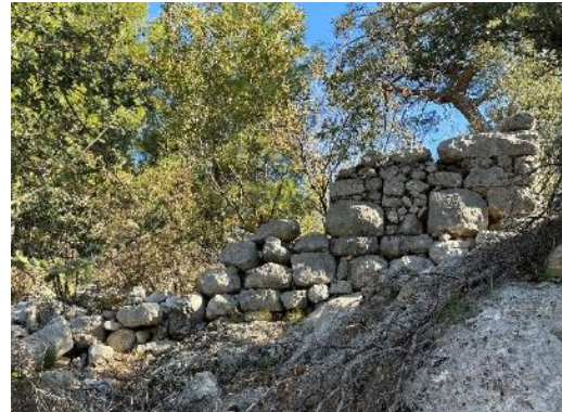
Fig. 8