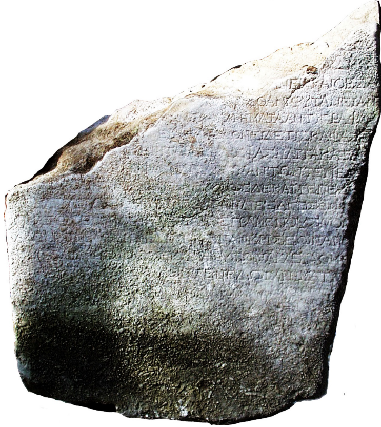
Fig. 3. The inscription from Hayıtlıgöl.

It was known that Tenedos and the Tenedans are mentioned in this inscription within the frame of an issue between the citizens of these two poleis , Phaselis and Tenedos, the ancient name of the site has constantly been named as Lyrnas (see fn. 10 above). The fact that the content of this inscription lacks from the related discussions has led the scientific world and the public due to a lack of information or misinformation about the ancient geography of the region and caused the continuance of certain stereotypical discourses.