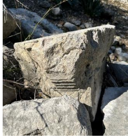
Fig. 11. Architectural fragment from the same building Fig. 12. Architectural fragment from the same building