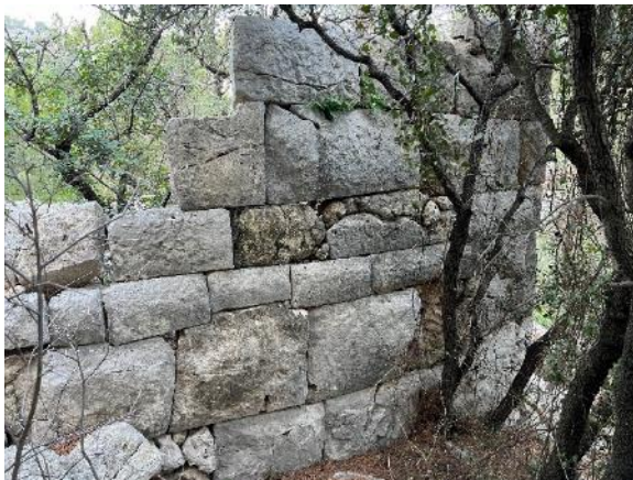
Fig. 15. The detail from the Hellenistic wall belonging to the building in Fig. 13