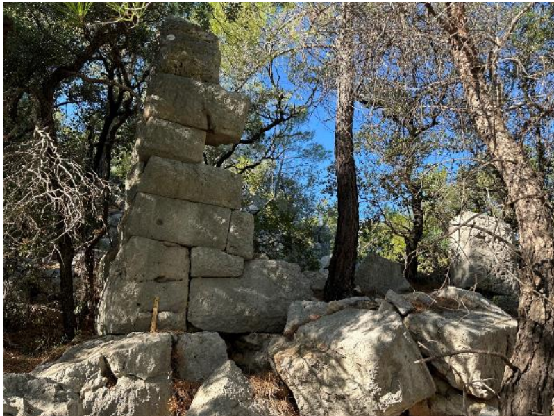
Fig. 13. A Hellenistic building on northwest side of the site (Photo by Gül Işın)

Fig. 11. Architectural fragment from the same building Fig. 12. Architectural fragment from the same building (Photo by Gül Işın)