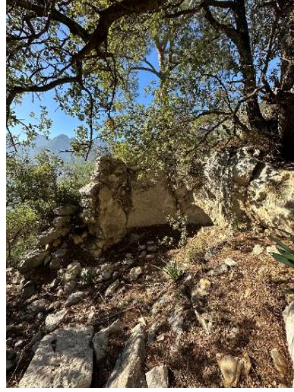
Fig. 20. A cistern on the acropolis