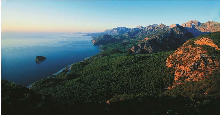
Fig. 1. Western Shore of Antalya Bay (Şahin 2014, 322)

Monumentum Patarense ( alias Stadiasmus Patarensis) of 45 AD, upon which our field surveys were based, provides little information for this part of the section after Phaselis to the north. What we have in the road list of this monument are three roads: From Trebenna to Attaleia of Pamphylia, from Trebenna to Onobara, and from Onobara to the “sea” or to “Thalassa” 2 . The road between Trebenna and Attaleia should have passed the Çandır River somewhere around or to the south of Hacisekililer then it should have led through Domuzağılı, where a Roman settlement with many sarcophagi existed, and Hurma, then passed Boğa Çayı finally reaching Attaleia via Konyaalti, Arapsuyu ruins, leading on the sea cliffs 3 . However, it is also possible that the road took a route through the upper parts of Boğa Çayı, then Bahtılı Village, Uncalı-Duraliler cemetery, where traces