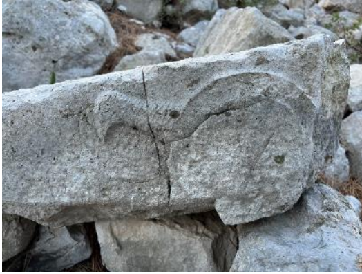
Fig. 21. A fragmentary relief of sword and shield