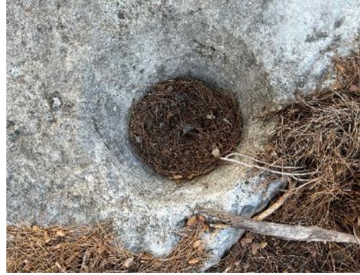
Fig. 22. Pit in the bedrock on acropolis