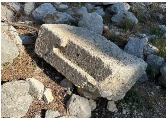
Fig. 17. Architectural fragment