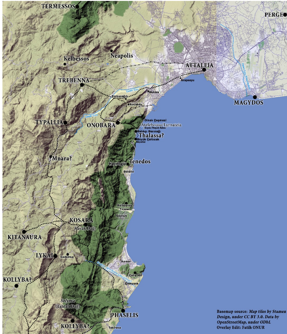
Fig. 2. The Map of Eastern Lycia and Western Pamphylia

reliable information on the locations and territories of the settlements on this coastline, while the literary sources from a variety of ancient and Medieval periods provide ambiguous and sometimes contradictory statements, which have puzzled researchers. Although there have been several attempts to localize the ancient cities known from the primary sources, no undoubted conclusions could be presented to-date. There were certainly settlements after Phaselis to the north, poleis or demoi , such as those transmitted in the sources: Tenedos, Idyros, Olbia, Lyrnas/Lyrnessos, Thebe and the “T/thalassa”, that is mentioned above. Of these, only Tenedos and Olbia were attested in the epigraphic evidence.