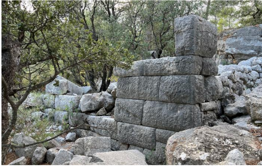
Fig. 14. Another Hellenistic building on northwest side of the site