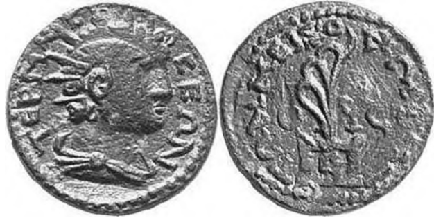
Fig. 25. Termessian coin with the asphalton on the reverse (Vitale 2011, 143 Abb.2; AE 20 mm; 5, 98 g; 12h)

It cannot easily be explained if Termessos did not have a connection with the sea in any period of history. The closest shore to Termessos is where the Boğaçayı meets the sea near the modern harbour, which is about 20 km south of Termessos. If Termessos had a port, it would have been somewhere between Balıkçı Barınağı (the new harbour of Antalya) and Antalya. But we do not have any evidence concerning this and there